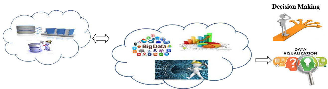
Figure: Data Mining Techniques with Big Data under Cloud Environment